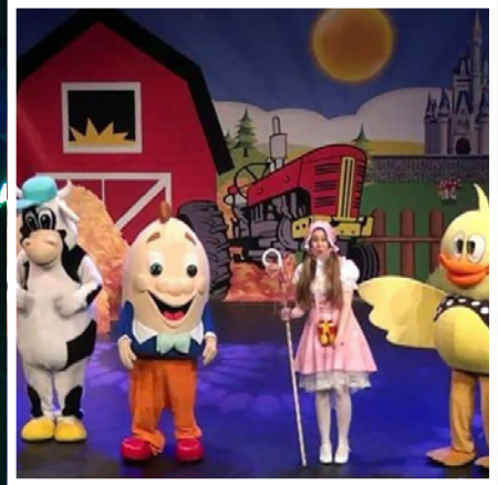
May Humpty Dumpty