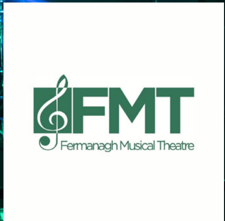
Fermanagh Musical Theatre