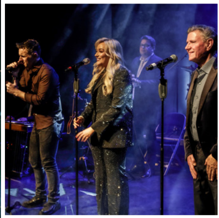
A Night at the Opry